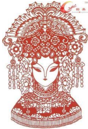
(Chinese paper-cutting artwork)

2.2 Making Hong Kong Traditional snacks (maltose cracker /Chop Candy(Ding Ding Candy)